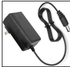
12V Ungrounded Power Adapter