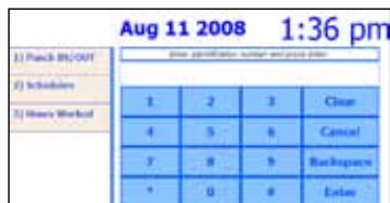
Centrally located kiosks provide secure access for all employees.

The system automatically evaluates each request against balances of the requested benefit and other outstanding leave requests. It also shows you the impact on scheduled labor, helping supervisors make better leave management decisions.