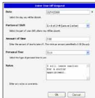
Employees can efficiently review benefit balances and request leave online.